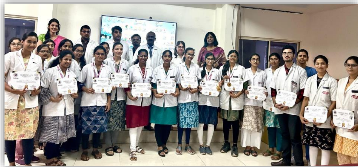
10) Award distribution for the meritorious students and the winners