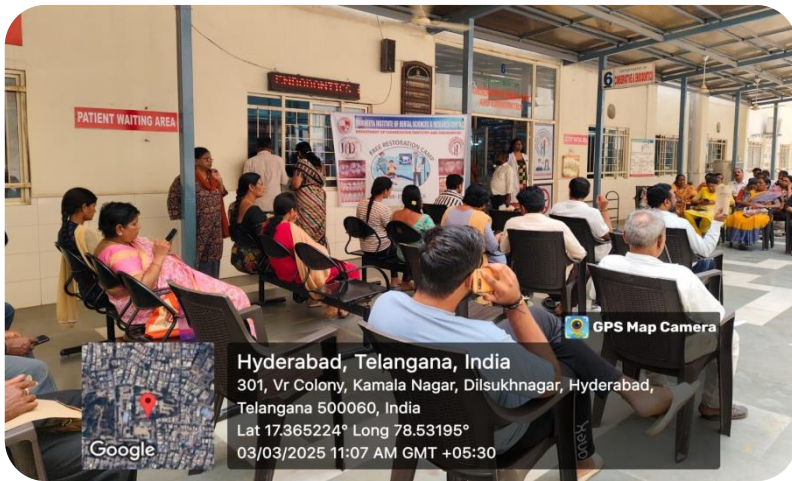
1) Free Restoration program