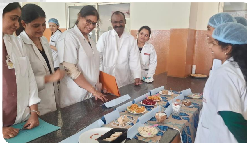
4) Flameless cooking