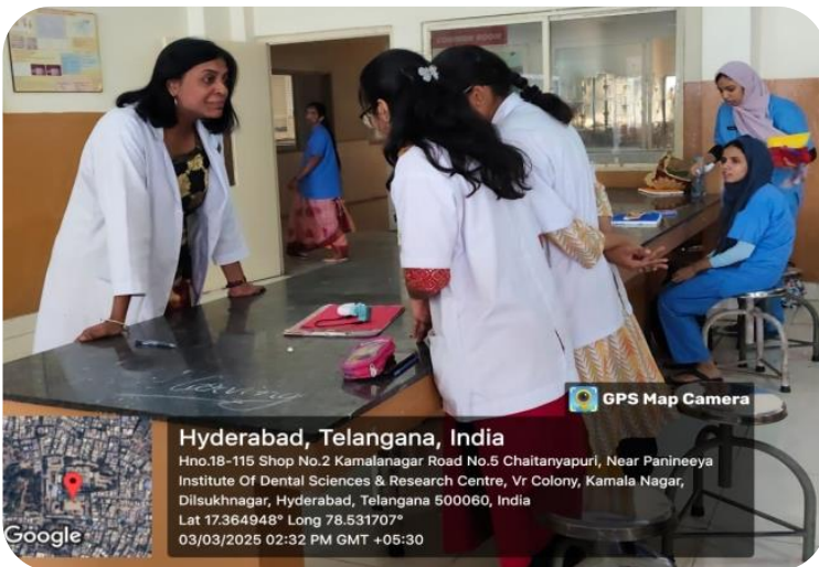
3) Soap and Vegetable carving