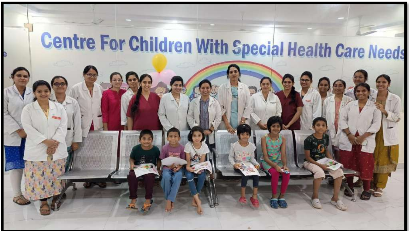
Group Picture with students and staff

DAY 3 – Childrens Day celebration in the department and screening camp at Thakur Hari Prasad Institute for special children and rehabilitation centre.