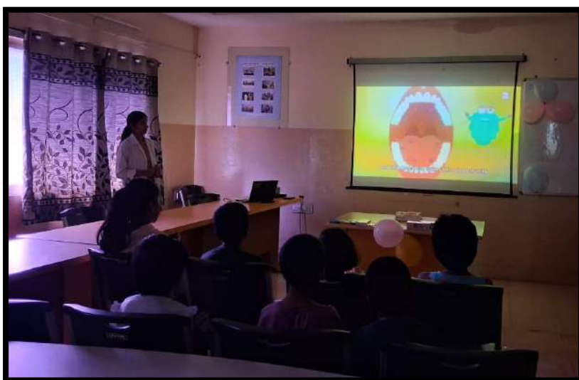
Oral Health talk and presentation to children by our PG students