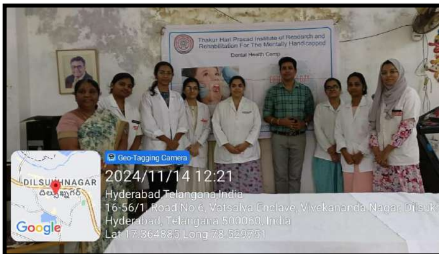
Group picture with the staff of the institution