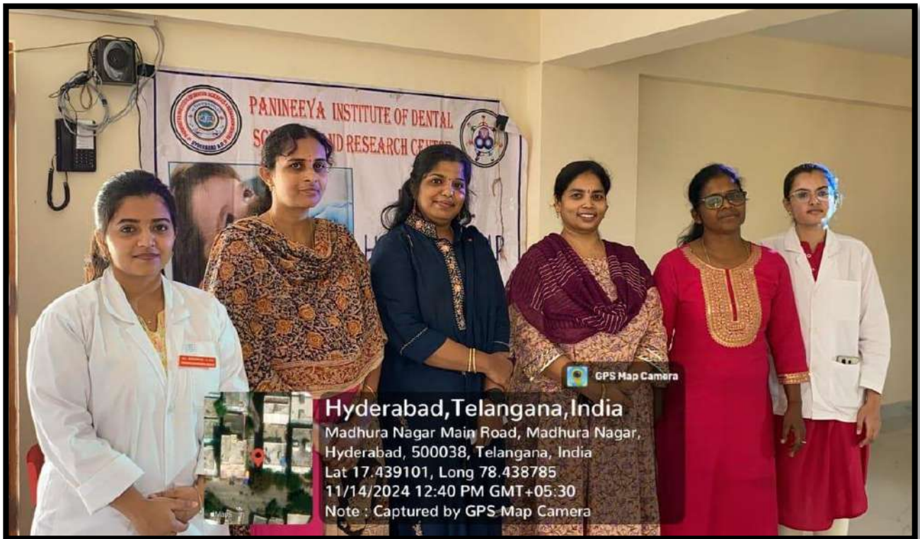
Group picture with school teachers