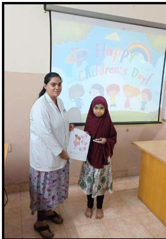
Certificates, gifts, crayon distribution for every children