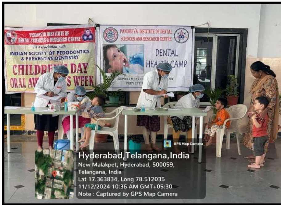
Camp team screening children

DAY 1 – Oral screening camp for 70 Preschool students of Samagna Montessori School, Saidabad