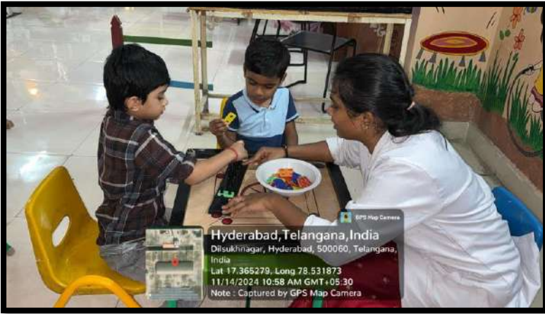
Fun interactive games among children and staff