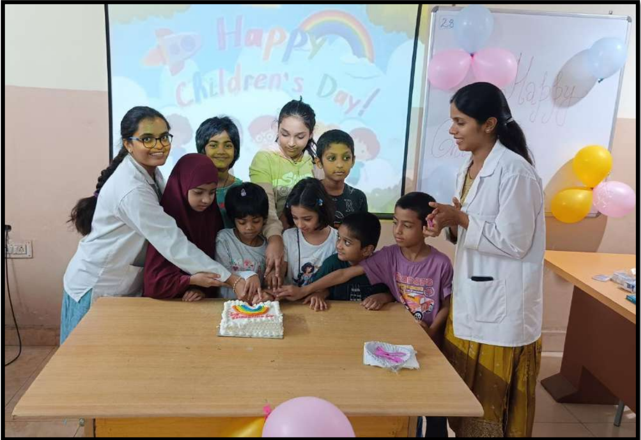
Cake cutting with the children