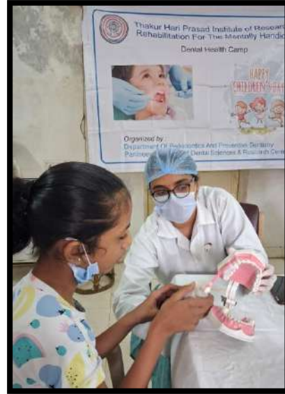
Oral screening and oral health education to special children and their guardians