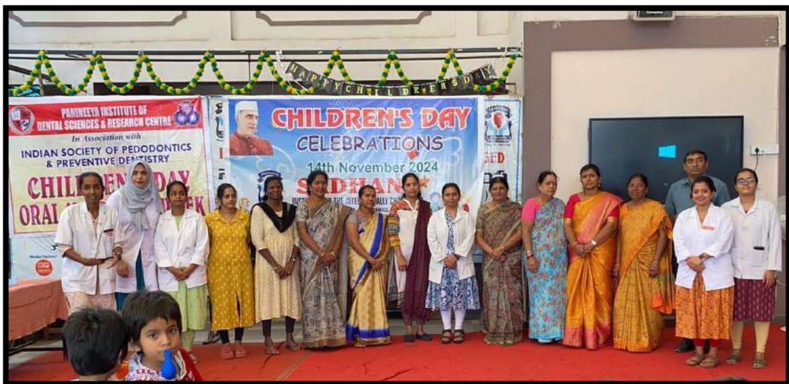
Group Picture with students and staff