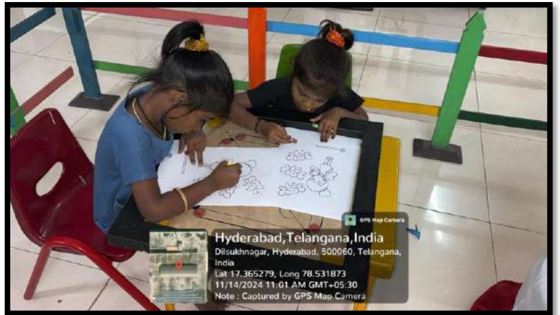
Dental related educative games