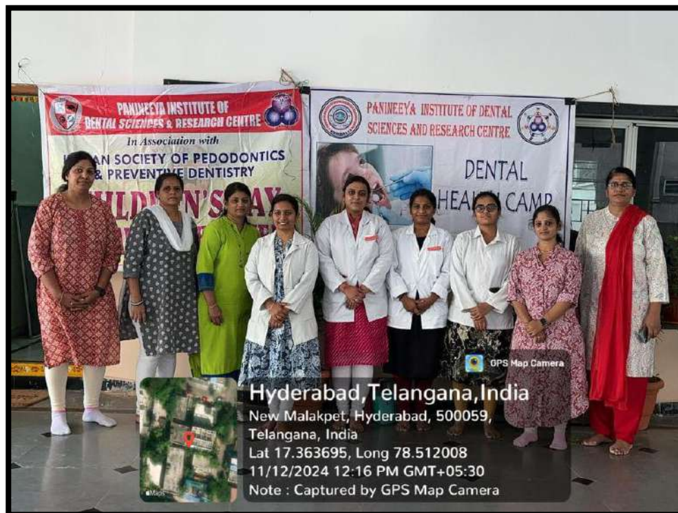
Group picture with students and camp team