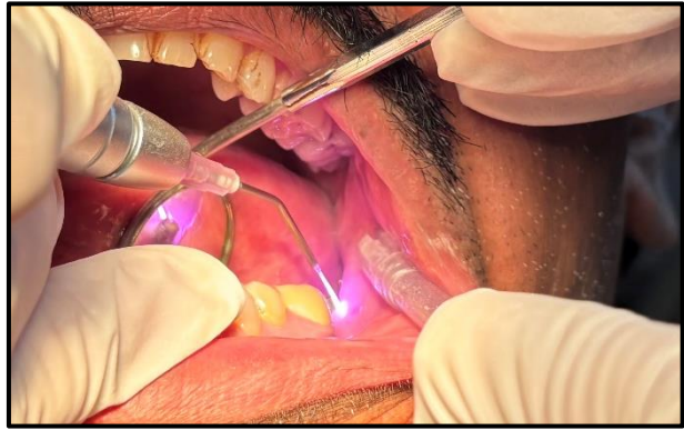
LASER CROWN LENGTHENING PROCEDURE