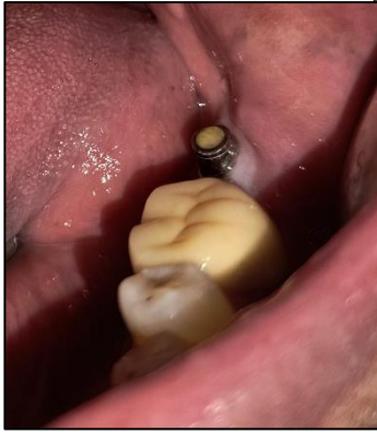
PREOPERATIVE PHOTOGRAPH OF IMPLANT ABUTMENT irt 37