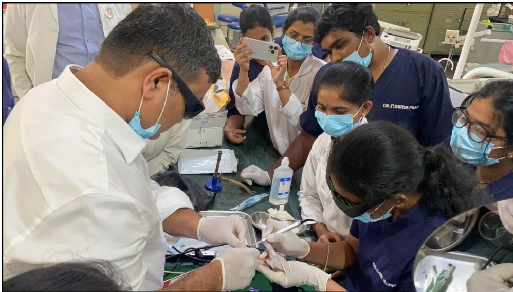
HANDS ON BY POST GRADUATE STUDENTS